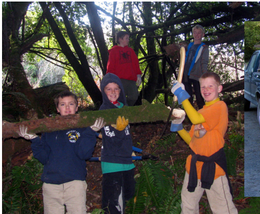
Scout Troop 88, Placerville