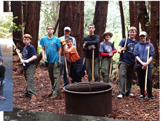
Scout Troop 999, Windsor