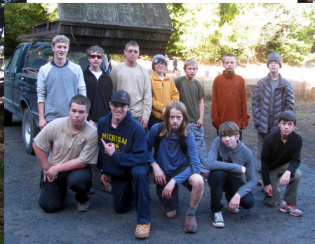
Scout Troop 135, Santa Rosa