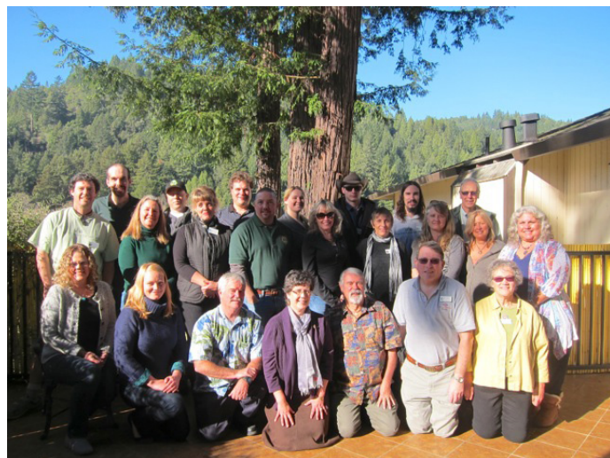
Board and Staff Retreat - November 2013

Wishing you all a very Happy Holiday Season.