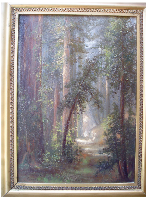
"In Armstrong's Redwoods"