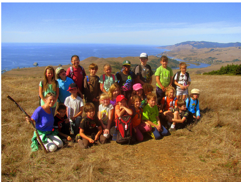
Salmon Creek School 4th graders participated in Watershed and Tidepool Programs.