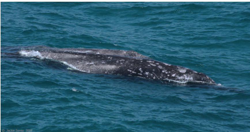
Photo of Cow and Calf off Sonoma Coast

The Los Angeles ACS census has counted 244 north bound calves this season and continues reporting sightings every week. Having been treated to close up views of many northbound moms and calves to date, we hope to see more throughout the month of May. Come join us and we will do our best to help you see our much loved Pacific Gray Whales!