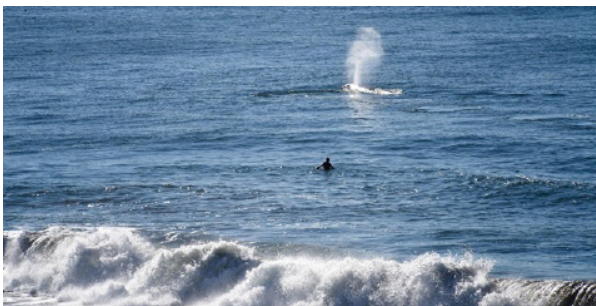
Humpback Whale & Surfer, Salmon Creek 11/28/15

As we wind down 2015, we look forward to the 2016 Whale Watch season and hope it will treat us