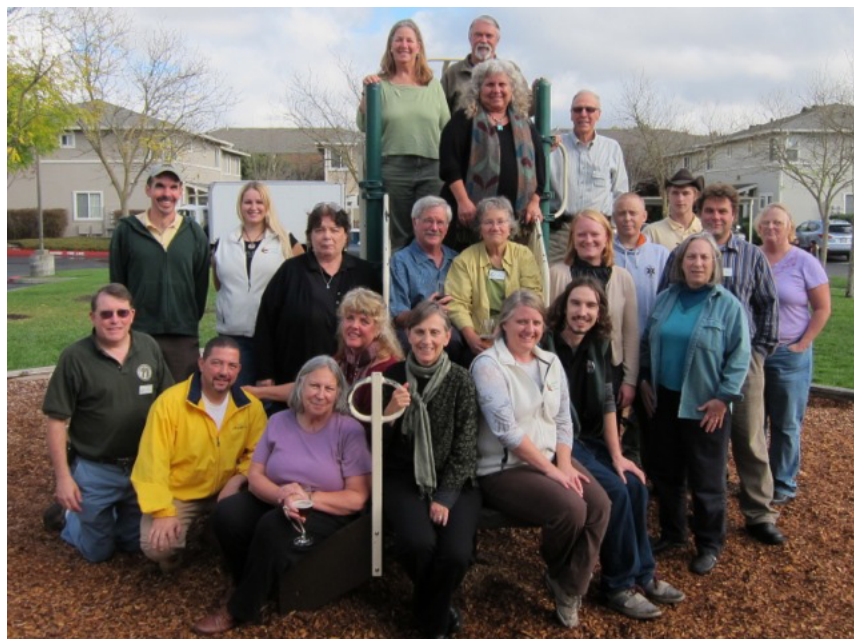
Board Members, Staff and our CAL at the Annual Board/Staff Retreat in November 2012