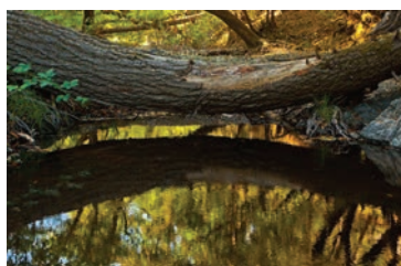
Austin Creek SRA