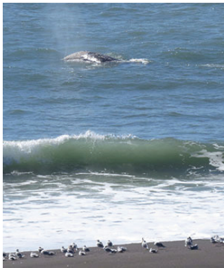
Whale at Goat Rock

Whale Watch has been going strong this year and we are getting close to the end. As usual we have had many dedicated and sturdy volunteers as we had some very blistery days on "Blowdega Head." In May, we had some fantastic shows, especially the cows/calves on their northbound migration with many breachings close to shore to the delight of not only our volunteers but many, many visitors.